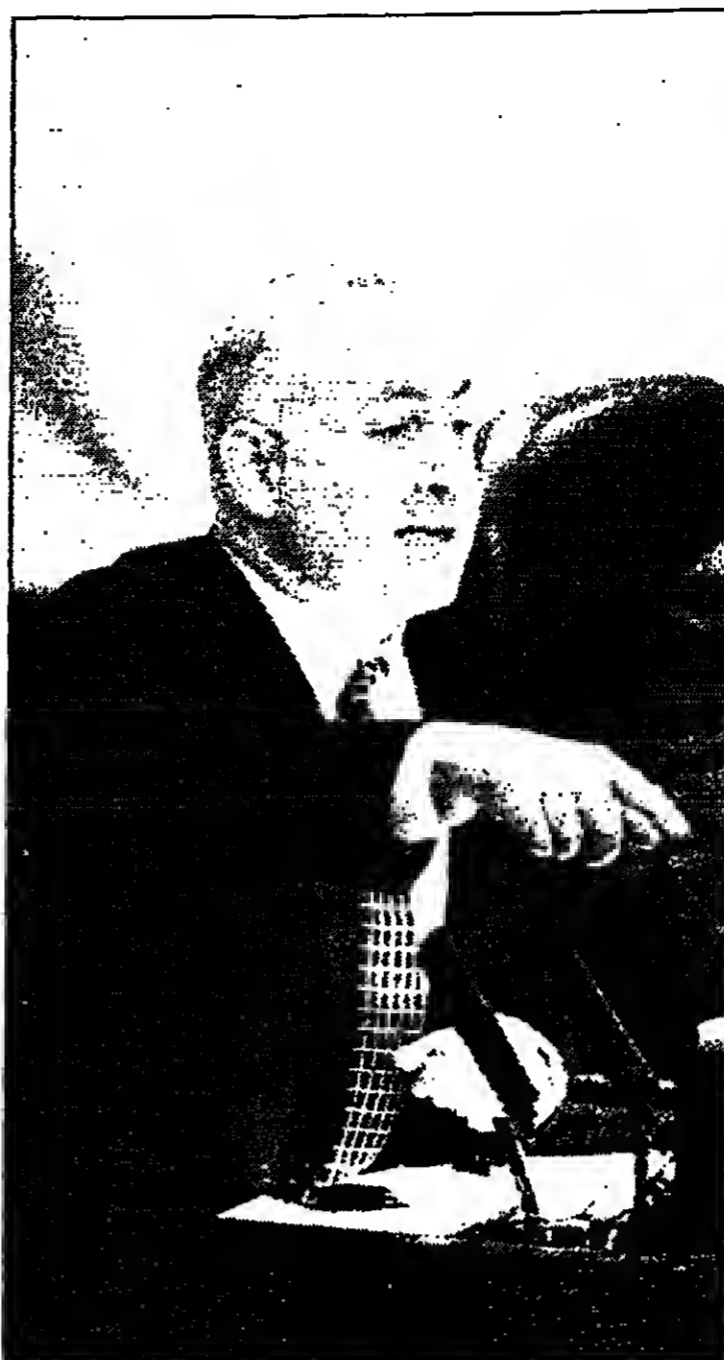
Prime Minister Binyamin Netanyahu and Labor Party leader Shimon Peres addressing the Knesset yesterday.